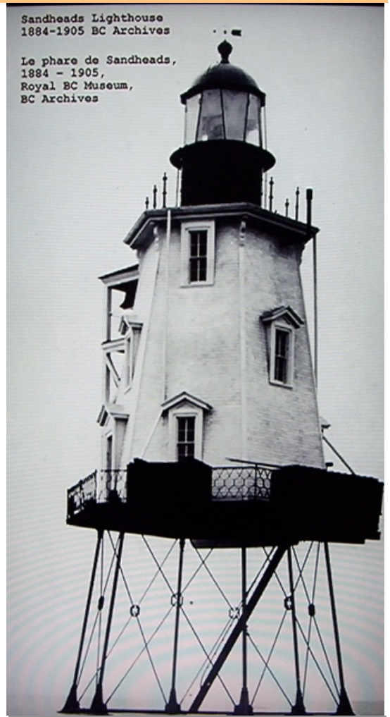
Sandheads Light: not your average cottage at the lake...

First page and station photo from Clark Gray's memoir article in CN Lines (CN Historical Society) a couple of years ago.