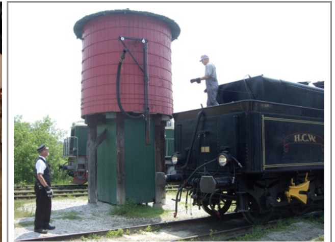
Fill-up time at Wakefield, Quebec